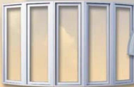
Bay and Bow