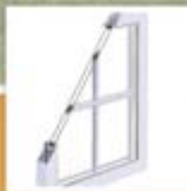
Interior Georgian grille* White or 2 colors