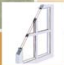
Simulated divided lite*