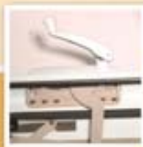
Opening system with retractable handle