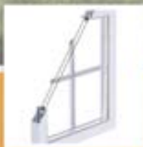
PVC removable grille*