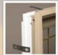
Brick mould with installation anchors