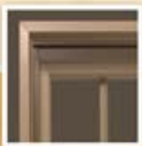
Choice of decorative aluminum brick moulds and casings