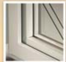
Insulated glass with THERMAL EDGE™ spacer bar provides energy efficiency